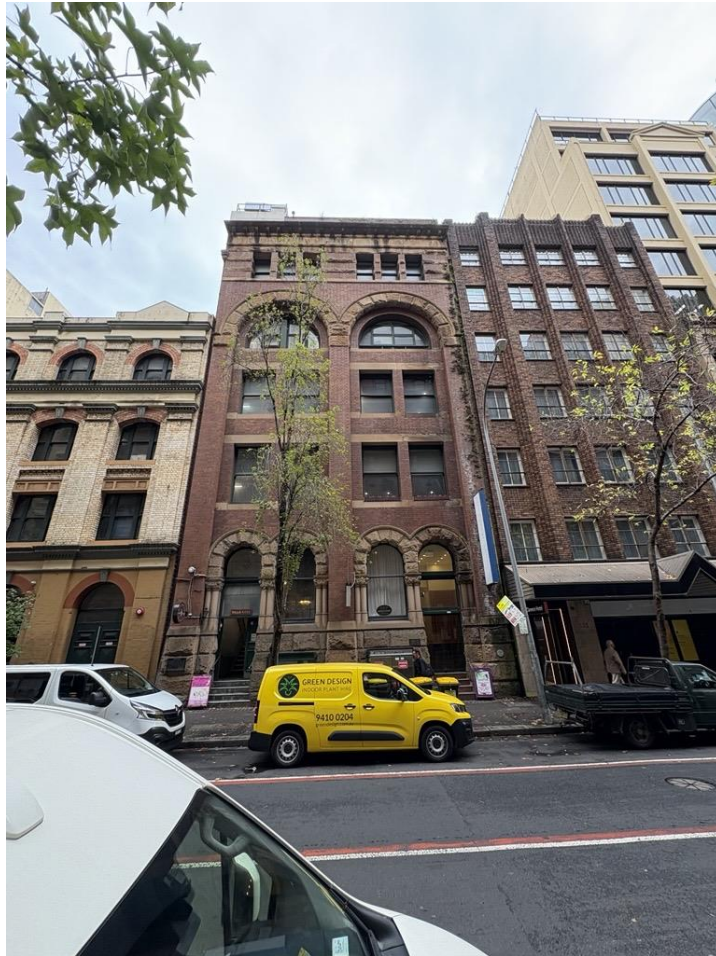
Figure 1: 199 Clarence Street, Sydney, viewed from the east